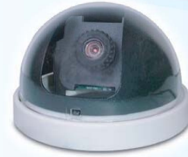
MS-C B x42