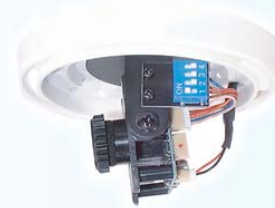
MS-C B x42E