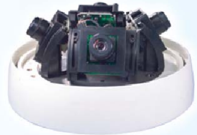
MS- C B 446F