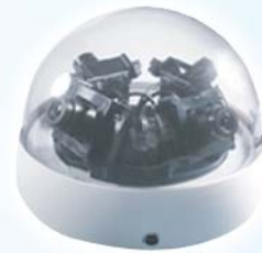
MS- C B 446FA