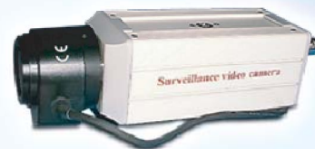
MS- C B x55x