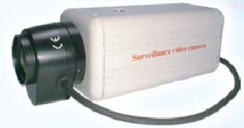
MS-C B x22x