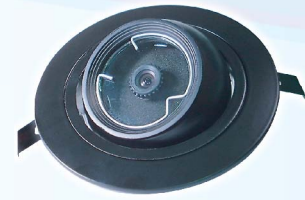
MS- C x51