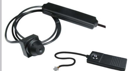
▲ OSD Control Stick

N-1871-3C + OSD Control Stick = N-1871E-3C