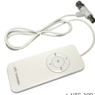
▲ UTC-100 (Sold separately)